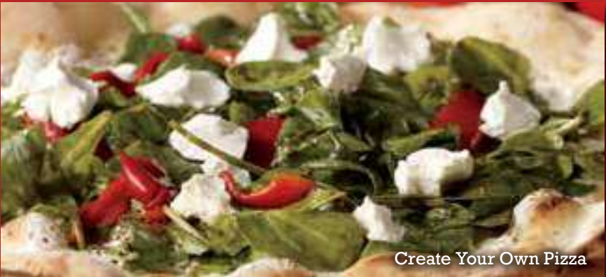
Create Your Own Pizza

Half Pie 3.75 ea | LG Pie 4.75 ea | XLG Pie 5.25 ea Crumbled Bacon | Housemade Breaded Eggplant Ricotta | Artichoke Hearts | Fire Roasted Peppers